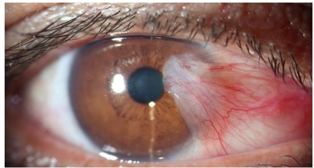
Figure 1: Grade 3 Pterygium

Amniotic Membrane Membrane Transplantation In Management Of Primary Pterygium-A